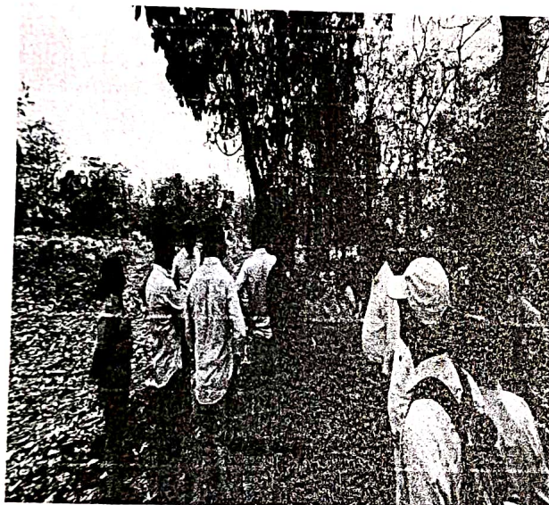
Fig: Site Photographs

Since the area under question falls beyond 50m of notified wetland Pilerne Lake, it is beyond the purview of GSWA.